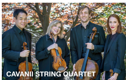
CAVANI STRING QUARTET