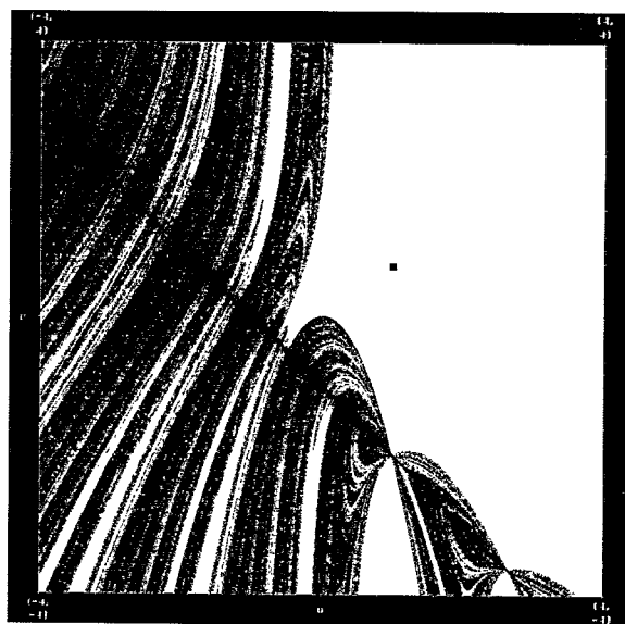
FIG. 2. This graph is the basin map associated with B_{0.75} . The black points have not converged to the fixed point (1, 0.75) (in black) in 200 iterations.