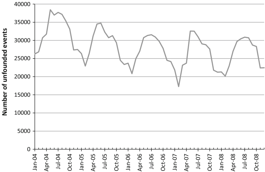
Fig. 1 Citywide temporal trends of unfounded events

that are founded represent more officer vigor than cases that are unfounded. Unfounding an event occurs at one of the earliest stages of processing. The ecological theory predicts systematic variation in the number of unfounded calls: The highest-crime districts should have the highest number of unfounded calls, as officers seek to balance their workload by not exercising authority in low-seriousness events. 3