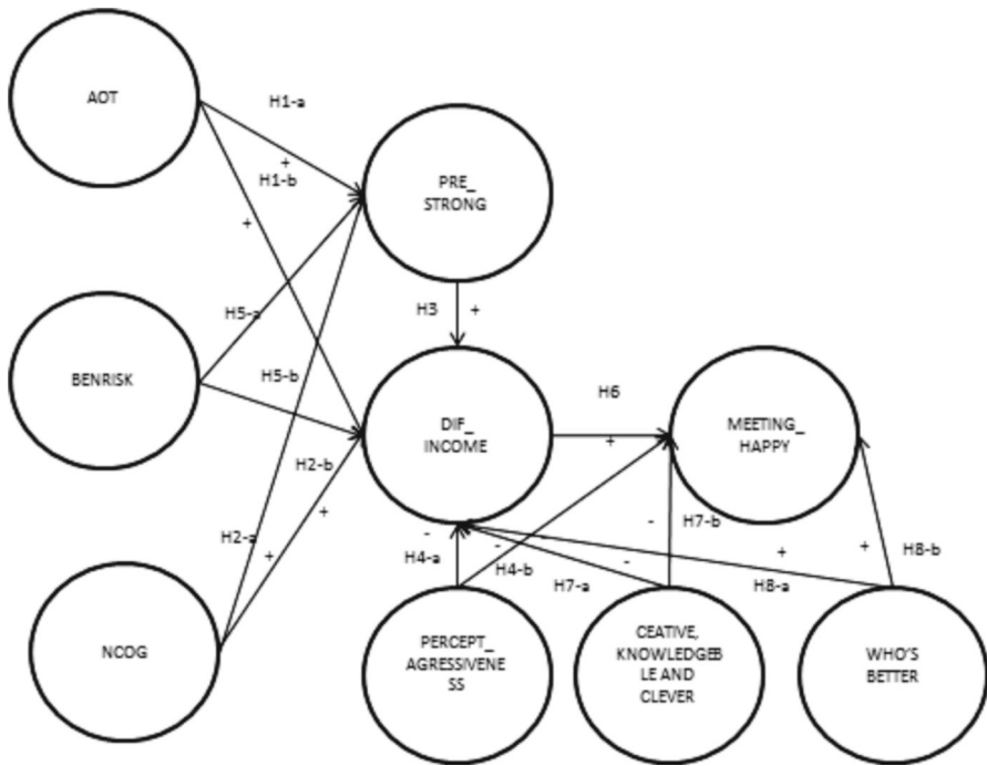
Fig. 1 Hypothesized model

counter to his or her own interest. Please see Fig. 1, specifically the arrows pointing from PRE_STRONG to DIF_INCOME (H3). Thus, we hypothesize that: