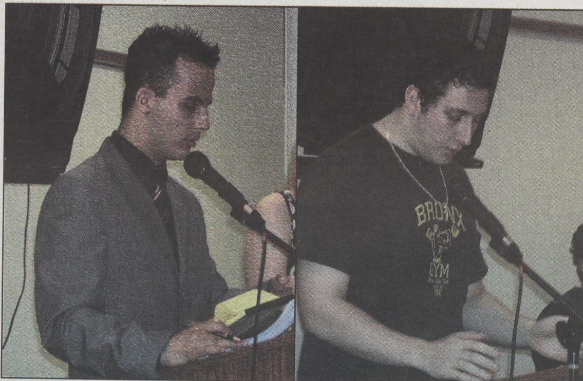
Brian Gatens | The Montclarion

He was also accused of failing to establish an adhawk committee to assist in the creation of an art magazine due to come out May 5.